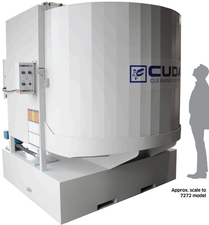
Approx. scale to 7272 model