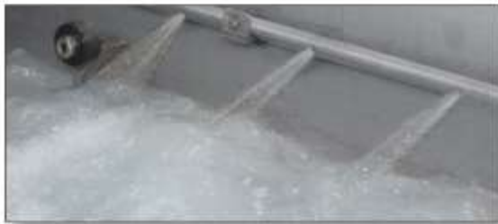
Oil and Debris Removal Sprayer Bar