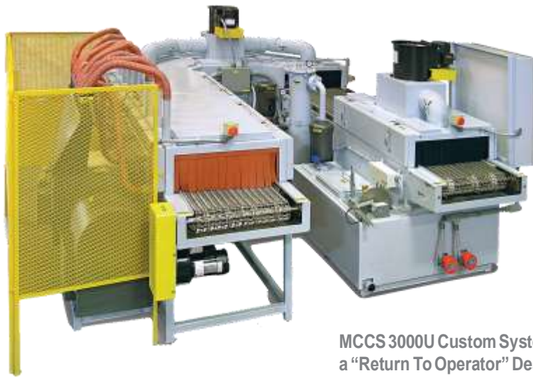
MCCS 3000U Custom System in a "Return To Operator" Design