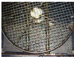
STANDARD 21" OR 25" TURNTABLE DESIGN PROVIDES TOOL-FREE REMOVAL FOR EASY TANK CLEANING