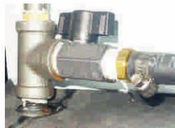
MANUAL FLOW VALVE FOR ROLL-TOP RINSE OPTION