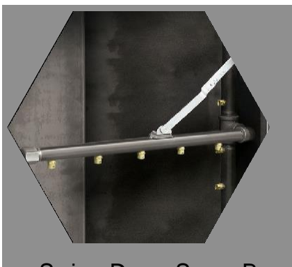
Swing-Down Spray Bar