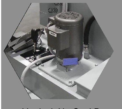
Vertical, No-Seal Pump