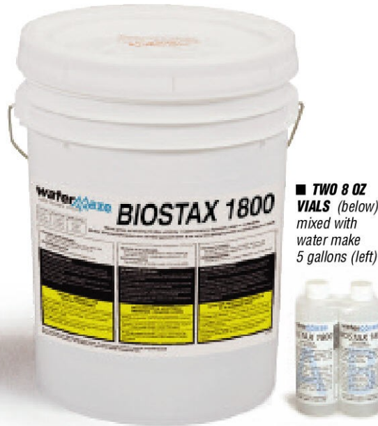
■ TWO 8 OZ VIALS (below) mixed with water make 5 gallons (left)

Important: BioStax 1800 must be kept refrigerated prior to use.